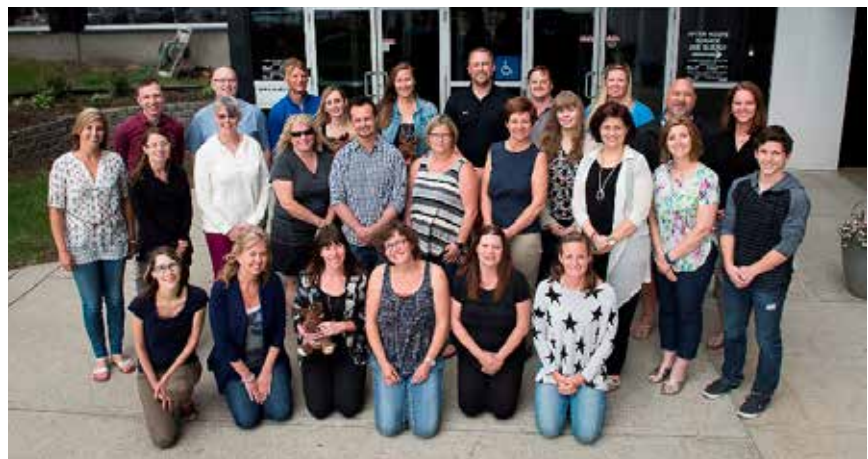
Teachers participating in the 2017 IEEP exchange in Australia

should be flexible, adaptable, positive, open to other cultures and comfortable with ambiguity. They should also have demonstrated leadership qualities. Interested? Find out more at www.ieep.ca .