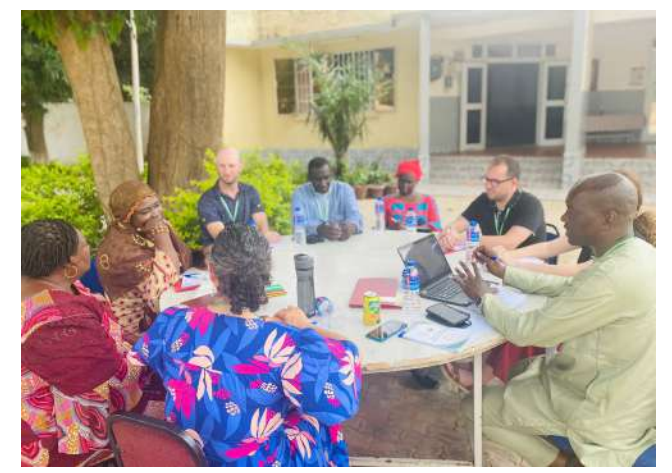
Project Overseas participants engage in a planning session with Gambian Teachers' Union officials and local cofacilitators.

n July 2023, I was able to fulfill a lifelong dream of Lvisiting the continent of Africa. I was fortunate to be part of a team of four teachers from across Canada who travelled to the extremely remote northeastern part of Uganda. The purpose of the project was to provide professional development sessions for teachers and administrators in the Karamoja region. Along with our Ugandan counterparts, we teamtaught two groups of teaching professionals over the course of two weeks. Each Can/Ugan pair delivered seven sessions in one of the following areas: leadership in education, classroom management, instructional strategies and learning styles/modalities. While the trip was exceptionally successful in meeting its purpose, the Canadian team also had a truly unforgettable experience.