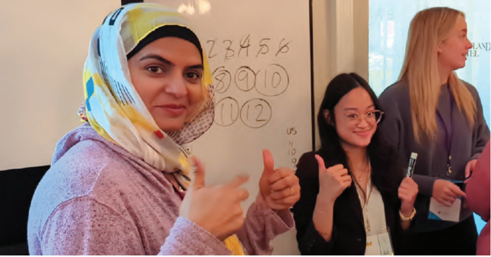
Participants give thumbs up for professional development.