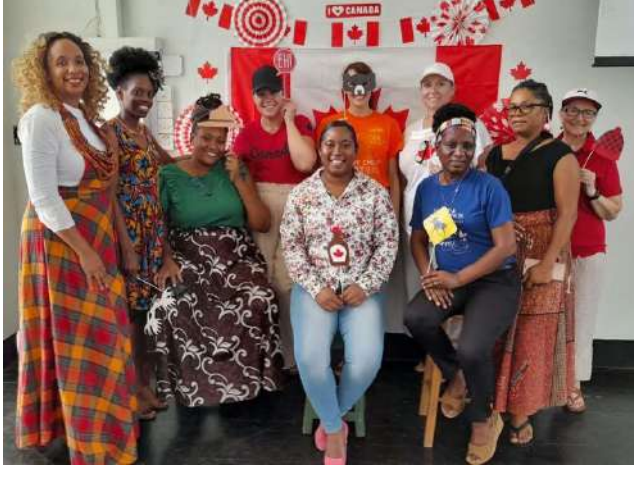
Participants from Canada and St. Lucia come together to share about their respective countries on Cultural Day.

Our team of women staved and worked in the